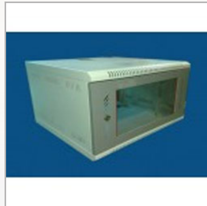
6U Rack Cabinet