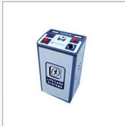
Scientific Equipment Enclosures