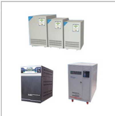
Online UPS Cabinets

We are a prolific manufacturer and supplier of the UPS Cabinets . Our company has a quality control mechanism that has provided the much needed quality trade-off with production. We are able to provide a much needed packaging facility that has been the mainstay of the packaging infrastructure.