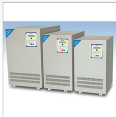
Online UPS 5kva