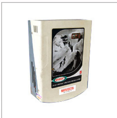
Wall Mounting Stabilizer Cabinets