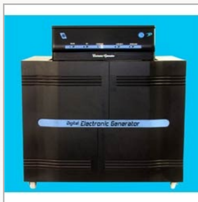
Single Battery Inverter Trolley