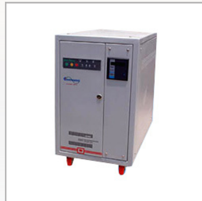
3KVA Online UPS Cabinets