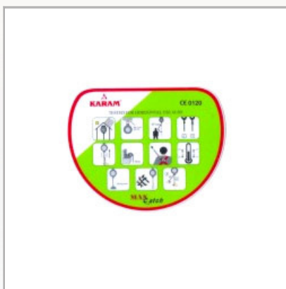
Self Adhesive Stickers

We are an eminent manufacturing and supply hub for Stickers and Labels . Having diverse application these products come in different outer characteristics. We have Stickers, Vinyl Sticker, Embossed, Security and Domed Labels and Membrane Keypad . The stickers are produced with designs of aesthetic and customizable outlook.