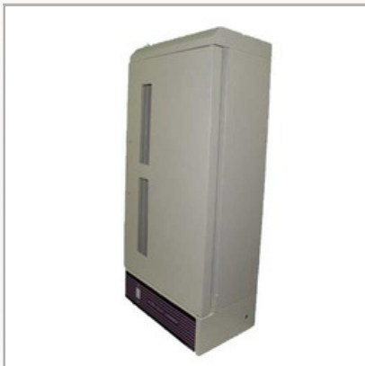
UV Chamber Cabinet

We are a pioneer in the manufacture of the Scientific Equipment Enclosure . These products find latest use in many industries. The uses are in the UV Chamber Cabinet and Scientific Equipment Enclosures . We have a capacious storage facility for the moisture free storage of the products.