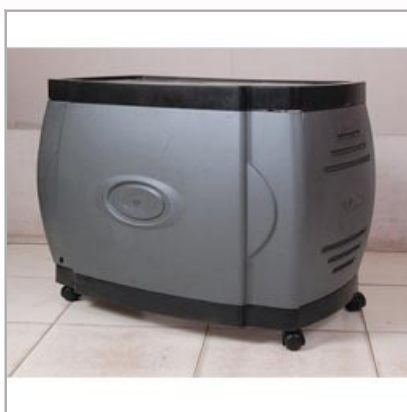
Plastic Inverter Trolley