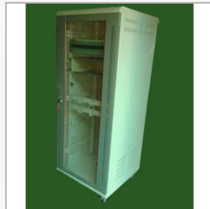
32U Server Rack