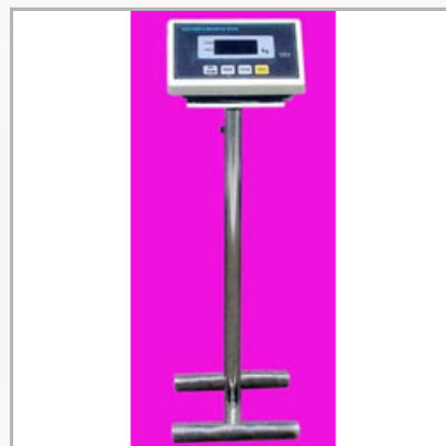
Platform Weighing Scale indicator Cabinet