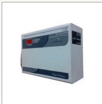
Wall Mounting Stabilizer Cabinets