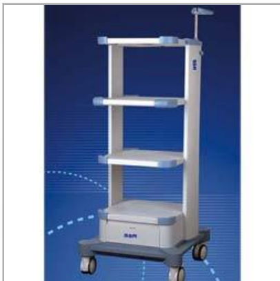
Operation Theater Trolley