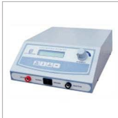
Scientific Equipment Enclosure