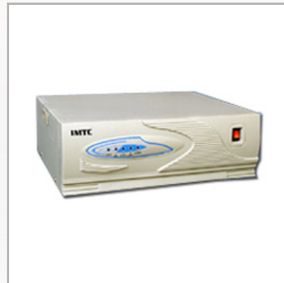
Inverter Cabinets & Enclosures