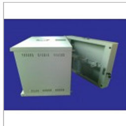
9U Double Section Rack