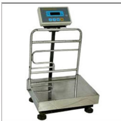
Weighing Scale Cabinet