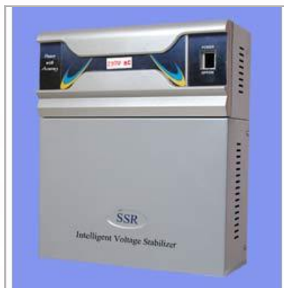
SSR 5KW Voltage Stabilizer