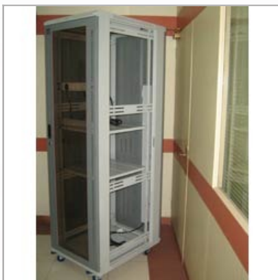
42U Server Rack