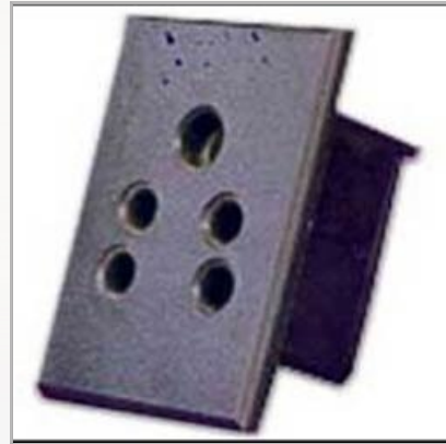
Wall Socket Plug