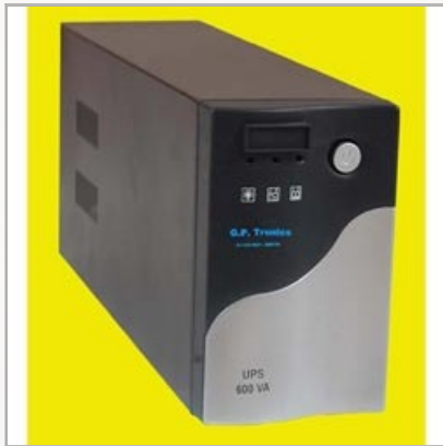
UPS Cabinets 600 VA