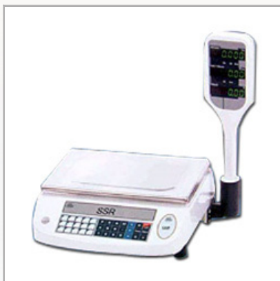
Table Top Weighing Scale Cabinet

We are one of the leading manufacturers and suppliers of wide range of Weighing Scale Cabinet . These are well fabricated with high quality raw material bought from reliable vendors. These weighing machine cabinets are highly durable and offer enhanced performance in various conditions. We offer these at market leading prices.