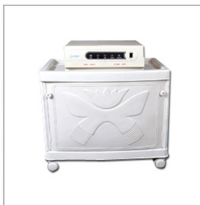
Plastic Trolley Moulds