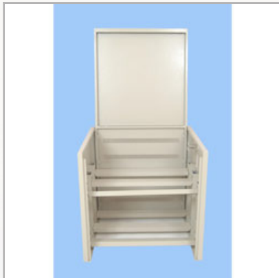
Online UPS Battery Cabinet