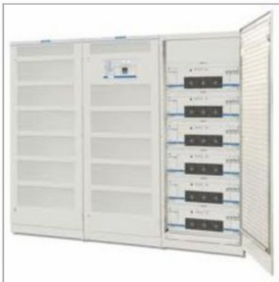
KVA Online UPS Cabinets