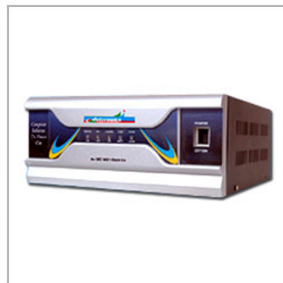
Inverter Cabinets & Enclosures