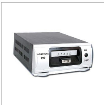
Inverter Cabinets & Enclosures