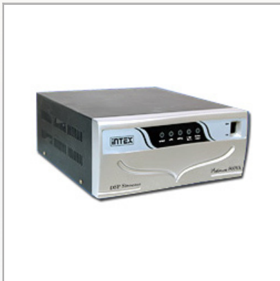
Inverter Cabinets & Enclosures

We are able to provide a consistent range of the products in the Inverter Cabinets and Enclosures . Our team is able to provide a large consignment of deliverables to the clients. The products having different power rating are well known for their performance. The raw material procured are from some of the best procurement agents.