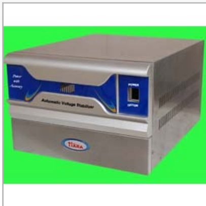
SSR-5KW Voltage Stabilizer Cab