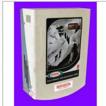
SSR-5KW Voltage Stabilizer Cab