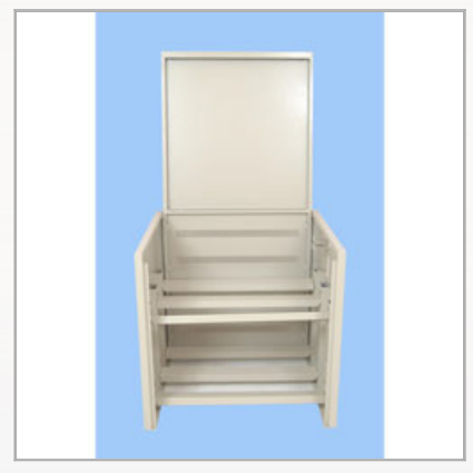
Online UPS Battery Cabinet