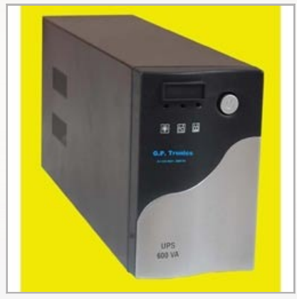
UPS Cabinets 600 VA