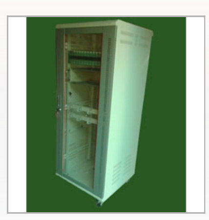
32U Server Rack