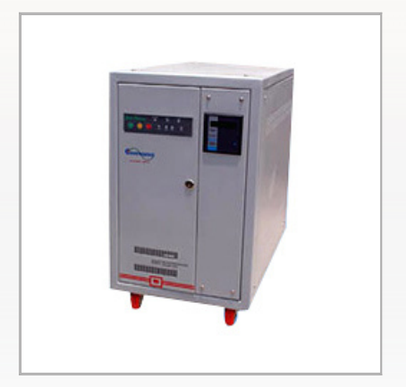
3KVA Online UPS Cabinets