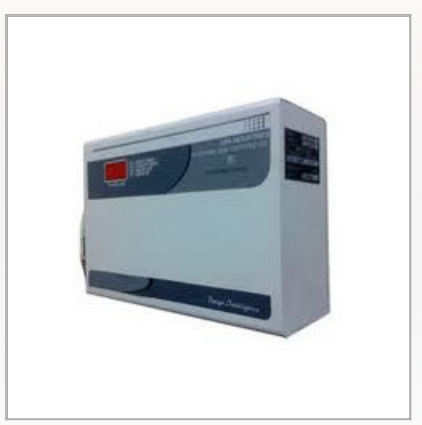
Wall Mounting Stabilizer Cabinets