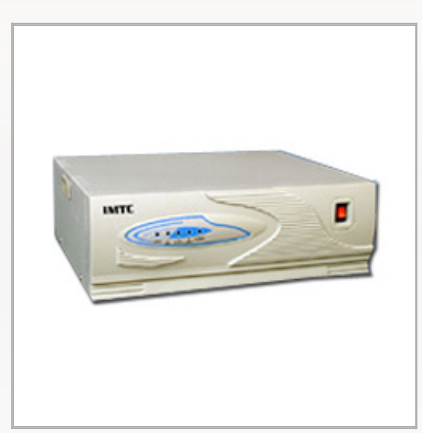
Inverter Cabinets & Enclosures