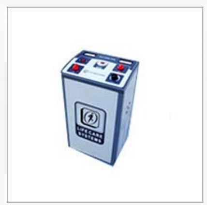
Scientific Equipment Enclosures