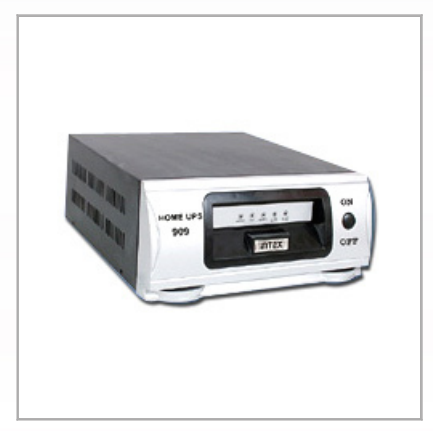
Inverter Cabinets & Enclosures