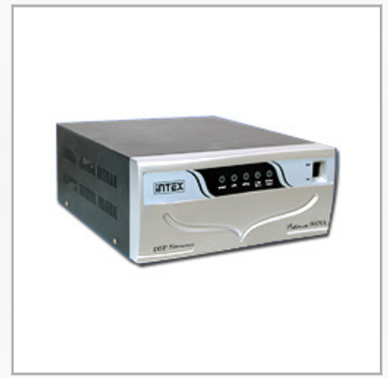
Inverter Cabinets & Enclosures

We are able to provide a consistent range of the products in the Inverter Cabinets and Enclosures . Our team is able to provide a large consignment of deliverables to the clients. The products having different power rating are well known for their performance. The raw material procured are from some of the best procurement agents.