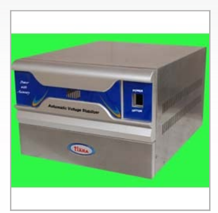
SSR-5KW Voltage Stabilizer Cab