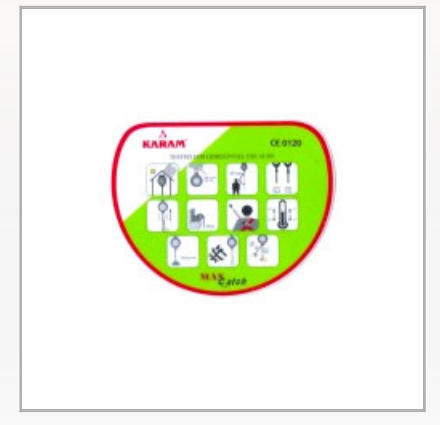
Self Adhesive Stickers

We are an eminent manufacturing and supply hub for Stickers and Labels . Having diverse application these products come in different outer characteristics. We have Stickers , Vinyl Sticker , Embossed , Security and Domed Labels and Membrane Keypad . The stickers are produced with designs of aesthetic and customizable outlook.