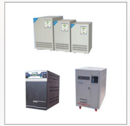
Online UPS Cabinets

We are a prolific manufacturer and supplier of the UPS Cabinets . Our company has a quality control mechanism that has provided the much needed quality trade-off with production. We are able to provide a much needed packaging facility that has been the mainstay of the packaging infrastructure.