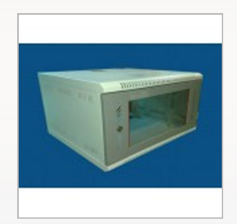
6U Rack Cabinet