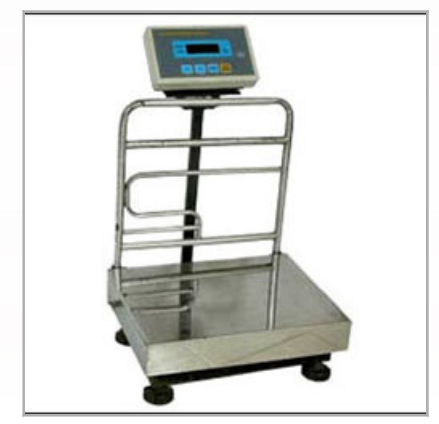
Weighing Scale Cabinet