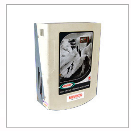
Wall Mounting Stabilizer Cabinets