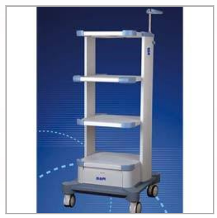
Operation Theater Trolley