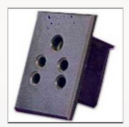
Wall Socket Plug