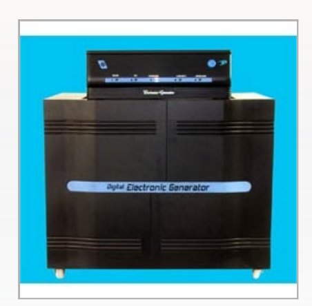
Single Battery Inverter Trolly