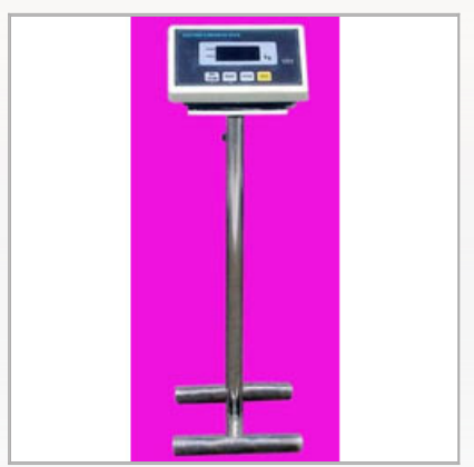
Platform Weighing Scale indicator Cabinet