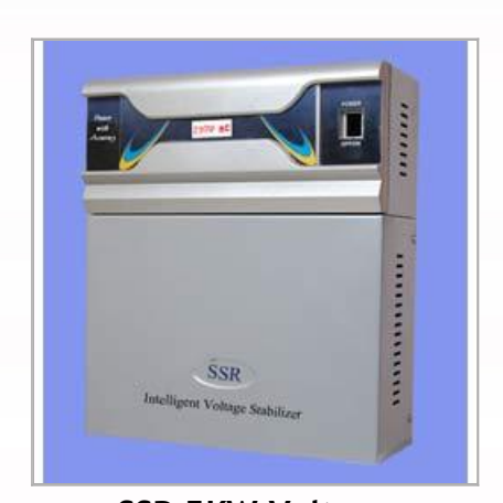
SSR 5KW Voltage Stabilizer