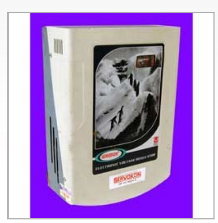
SSR-5KW Voltage Stabilizer Cab