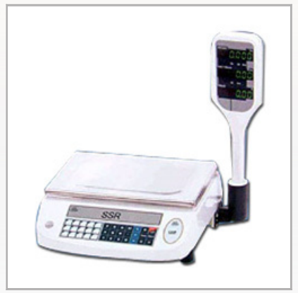
Table Top Weighing Scale Cabinet

We are one of the leading manufacturers and suppliers of wide range of Weighing Scale Cabinet . These are well fabricated with high quality raw material bought from reliable vendors. These weighing machine cabinets are highly durable and offer enhanced performance in various conditions. We offer these at market leading prices.