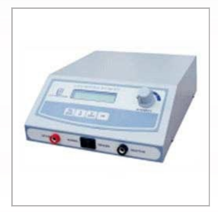
Scientific Equipment Enclosure