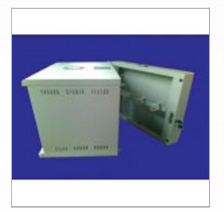
9U Double Section Rack