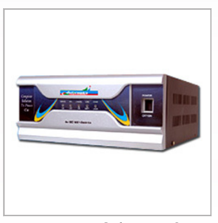
Inverter Cabinets & Enclosures