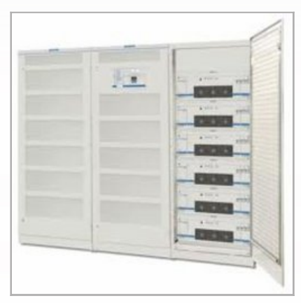
KVA Online UPS Cabinets