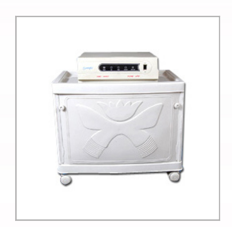
Plastic Trolley Moulds