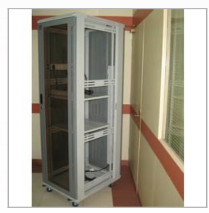
42U Server Rack