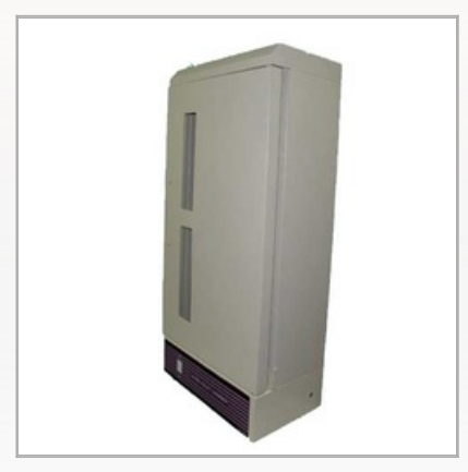
UV Chamber Cabinet

We are a pioneer in the manufacture of the Scientific Equipment Enclosure . These products find latest use in many industries. The uses are in the UV Chamber Cabinet and Scientific Equipment Enclosures . We have a capacious storage facility for the moisture free storage of the products.