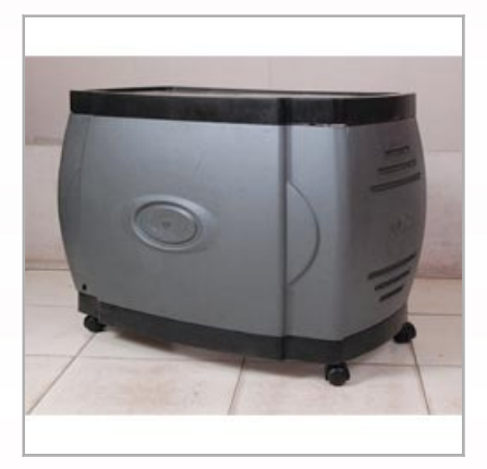
Plastic Inverter Trolley