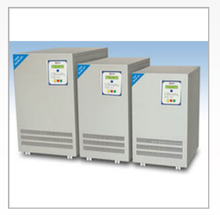
Online UPS 5kva